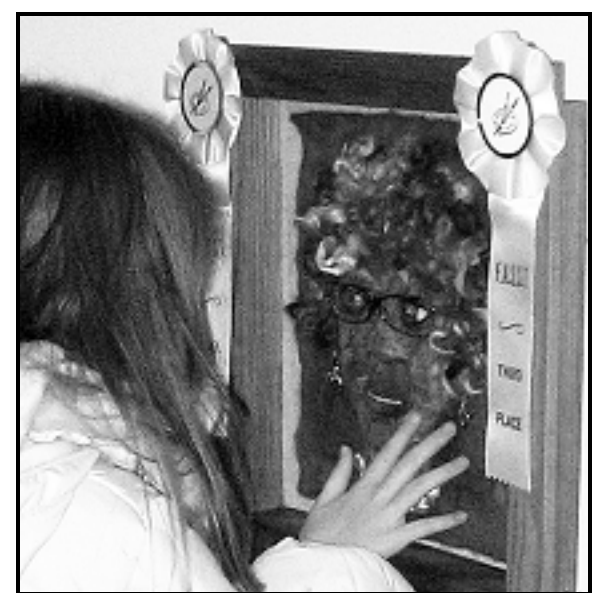
A child explores a felt-wool portrait with her fingers.

But, the best part of the show were the over 150 people who came to enjoy the art through their sense of touch – or sight! The show was such a huge success, FASST and A.V.R.E. have committed to making it an annual event. Keep your eyes and ears open for information about next year's show. You won't want to miss it!